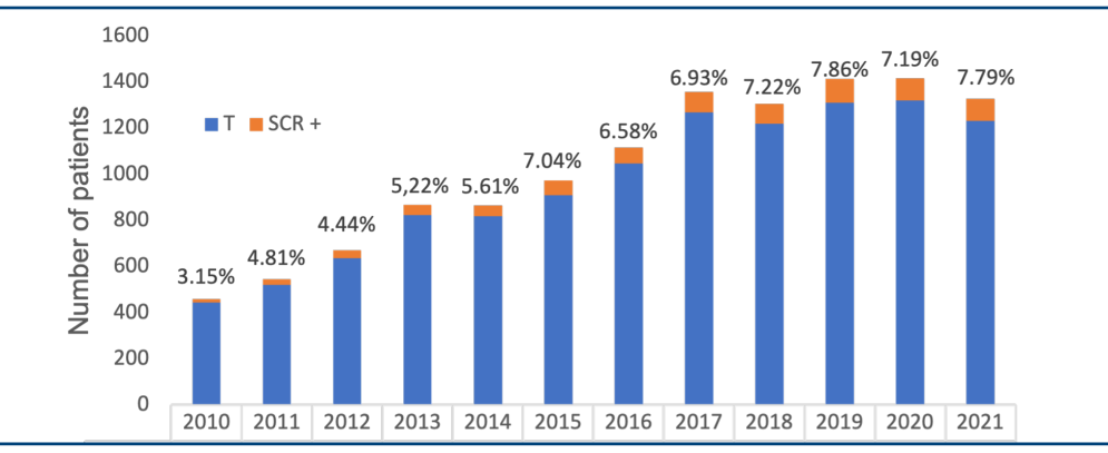
Figure 1. Changes in the incidence of patients starting PD for CRS since 2010.